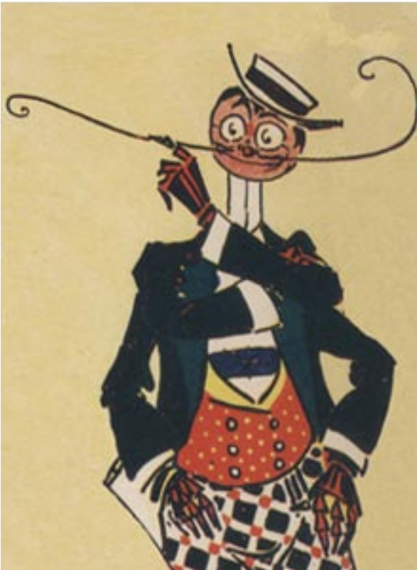
From the story The Unique Adventures of the Woggle-Bug Part Two , picture 12.

personification : the act of relating human qualities to different objects or ideas