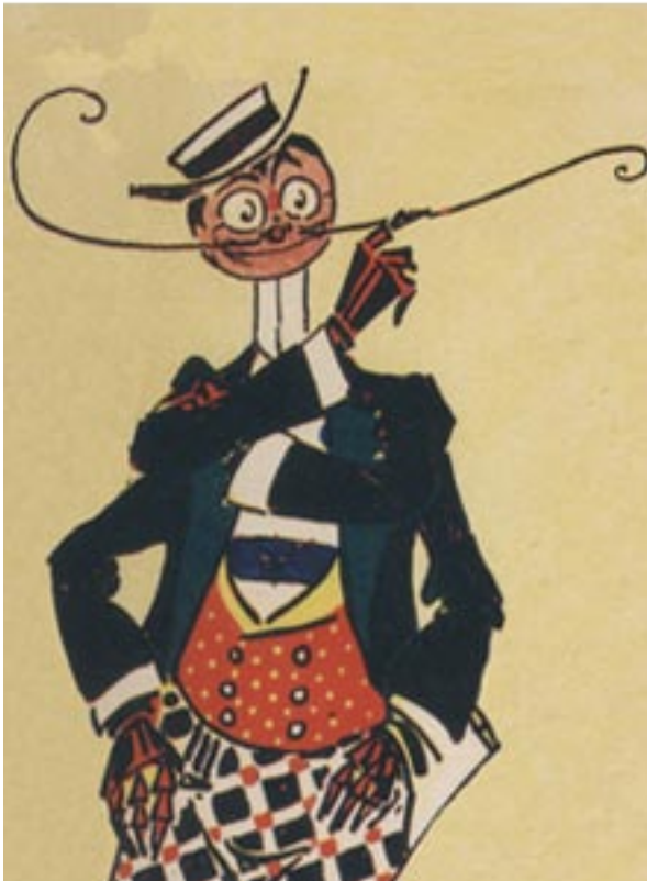
From the story The Unique Adventures of the Woggle-Bug Part Two , picture 1.