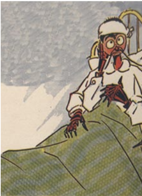
From the story The Unique Adventures of the Woggle-Bug Part Two , picture 3.