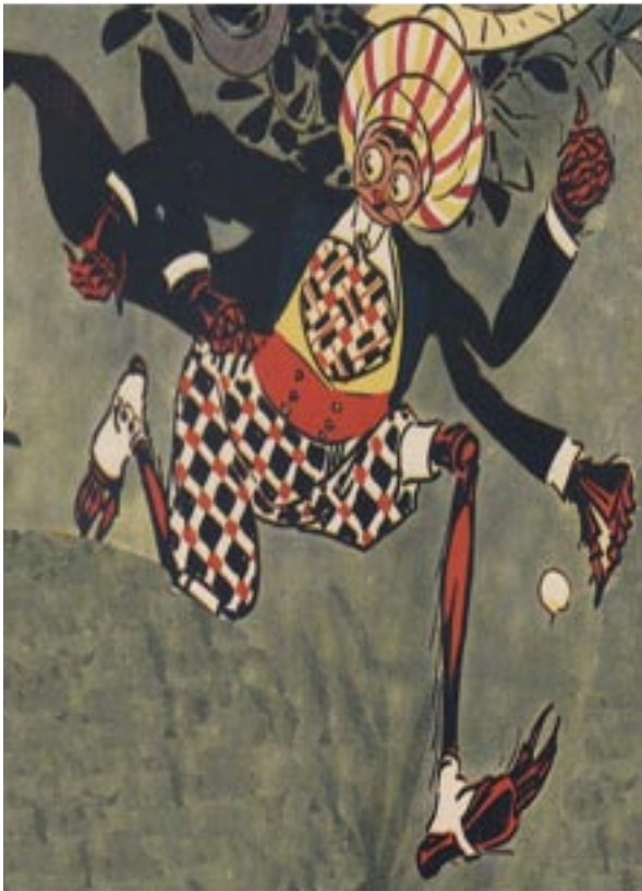
From the story The Unique Adventures of the Woggle-Bug Part Two , picture 50.