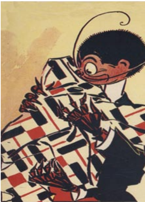
From the story The Unique Adventures of the Woggle-Bug Part Two , picture 15b.

parcel : something wrapped up or packaged