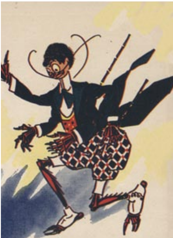
From the story The Unique Adventures of the Woggle-Bug Part Two , picture 10.